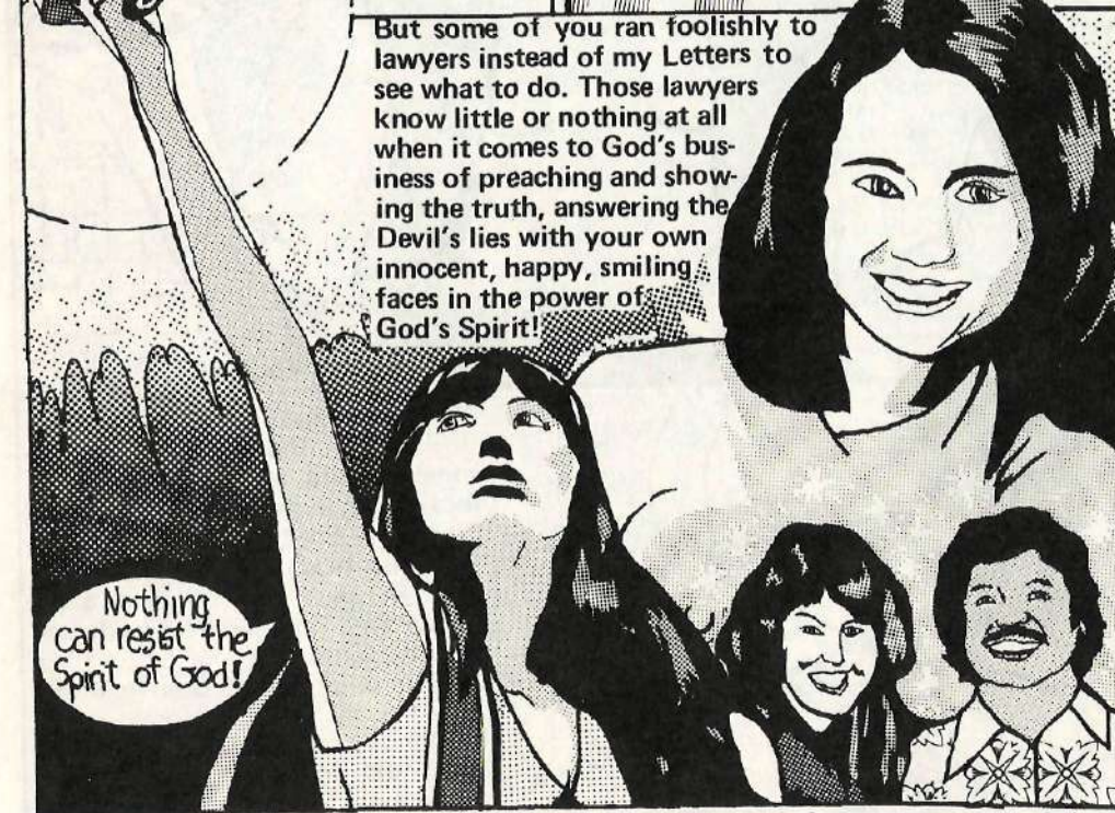
By Father David from Letter No. 3188 (Written: Nov. 1974)

But some of you ran foolishly to lawyers instead of my Letters to see what to do. Those lawyers know little or nothing at all when it comes to God's business of preaching and showing the truth, answering the Devil's lies with your own innocent, happy, smiling faces in the power of God's Spirit!