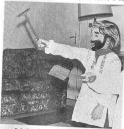
Rebuke the devil & he will flee!