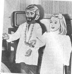
Song of victory after the Temptation!