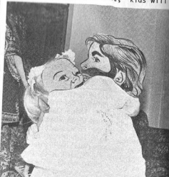
"... & the 'angel' came & ministered unto him!"