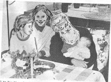
All Hail to Our King, Queen, Prince & Baby Princess!

children when it comes to TV or movies etc. so that they fully understand & will not get the wrong impression or even bad impressions from what they see on the screen. But just this time Daddy was making it a lot more mysterious & fun! The