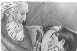
Grandpa Story Time together!