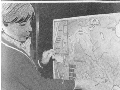
Dito charts the travels of Abraham on a wall map of Canaan!

ture on at least every 3 or 4 pages of our notebooks if possible so the children will enjoy reviewing & showing it to other people as a witness of what they've been learning in school. (Maybe you big people can learn something about the Bible this way, ha!)