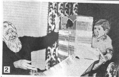
A huge crane toy--battery operated!