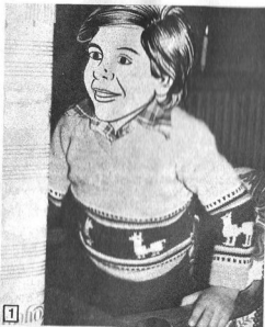
"It's so big!--What could it be?"