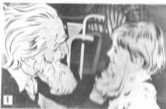
1 Daddy makes it fun by acting out all his stories!