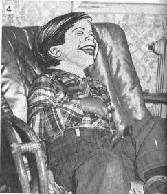
4 ...till he almost falls out laughing at funny Daddy!!