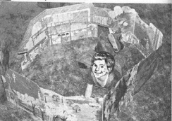
Dito in the kids' portable fold-out "farm" --colourful scenes on 9 reversible cardboard panels.--Makes a reversible playhouse!

34. AH, SO GOOD TO BE AT "HOME" AT LEAST A SAFE PLACE TO CALL HOME FOR A LITTLE WHILE! We were all happily reunited once again, feeling safe & secure, protected by other Family members, & now faced the big job of passing on all the many lessons of our past experiences with you, via Paper Power!