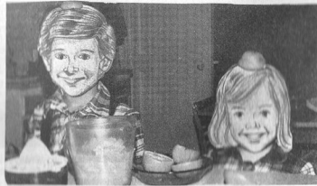
Making fresh-squeezed orange juice for Mommy & Daddy!