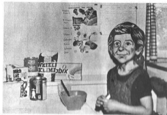
Healthfoods chart--a sample, not a sermon!