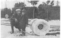
Our first snow!

recorder, & I day it led us to the idea of planning a puppet show by using a few foreign dolls & stuffed animals that he has. He was so excited to decorate the whole room & make props etc. He was real excited about it all day! Admission was a verse in exchange for a red heart sticker. We made invitations to invite everyone to the show after dinner, including Mommy & Daddy!