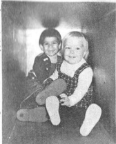
A box makes a favourite flying place!

3. ALIBRANES, THANK THE LORD!—HE'S TURNED ON TO A NEW THING! We're so happy about his interest in airplanes! He's been reading a lot about them lately & is learning a lot of the terminology, likes flying a kite & even drawing "flying machines"!