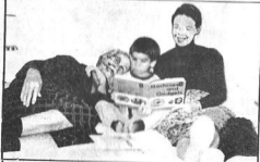
Reading at midnight for Mommy & Daddy!