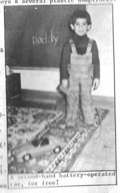
Remember this tip from Daddy: Be sure to clean all second hand toys, books & materials very well! A rechargeable battery-operated car, for free!

27. DADDY LIKES TO SEE DITO'S EYES GO BIG WITH EXCITEMENT when telling him exciting stories, for example about hobgoblins, witches & ghosts creeping outside in the dark. Dito often talks about hitting the hobgoblins with a stick when we're out at night--his wild imagination leads him on & on--he loves it!