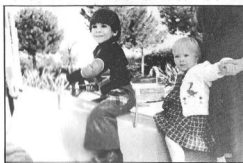
Weekend outings--At the playground.