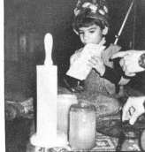
"We keep boys in all sorts of ways while Daddy talks to the family after dinner...Here's a snacktime on the floor & that's the paper trash can for my hat!"