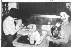
Yes! We're eating at Burger King!