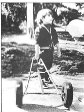
He "mows" the lawn with his old golf cart frame we found.