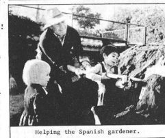
Helping the Spanish gardener.