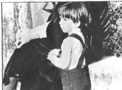
Waiting at the feet of the King!