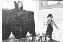
Homemade bowling game, with scoreboard