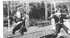
Swinging, with safety belts!

11. PLAY: THE LORD HAS PROVIDED SUCH NICE PLAY EQUIPMENT IN OUR NEW HOME! Not only a big garden, but a store room full of used toys & supplies & a big chalkboard! He's tried to learn tennis with his own little tiny racket & has actually learned to bat the ball over the net. We've played badminton, ping pong, & he plays on the climbing frame, slide & swings daily, plus gets lots of running & kicking exercise.