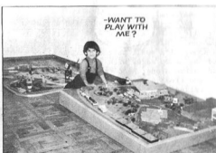
-WANT TO PLAY WITH ME?