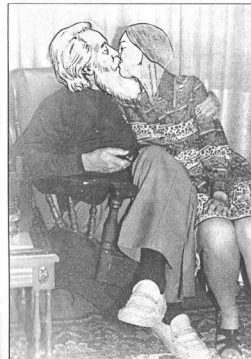
Aren't they beautiful?—What a Family!