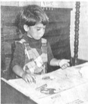
Creative fun with modeling clay

7. HE'S SHOWN A NEW INTEREST IN SEASHHELLS since we've been able to gather a few at the beach here. He'll compare the shells we get here with the pictures in