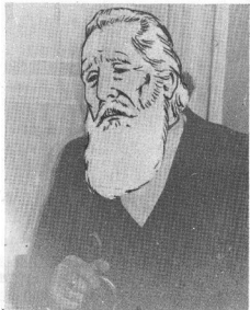
Dad imitating a sad-sack!