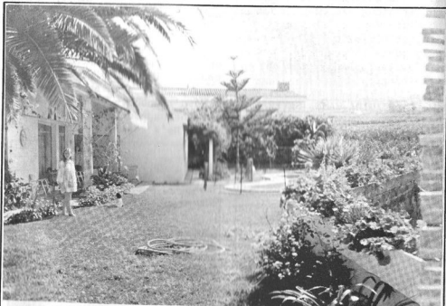
The Prince's Garden

OFFEND THE PEOPLE , but they all understood this because they knew that Dad was a man of God and if he had prayed for the baby, then she was surely blessed! Hallelujah!