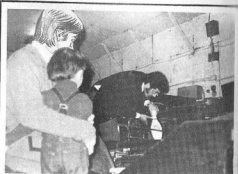
...and exploring the pin machine at bowling alley.