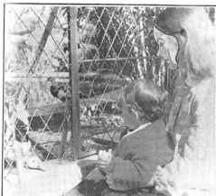
A visit to Puerto Botanical Gardens and to feed the ducks.