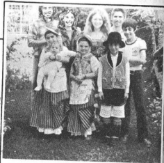
One of my first excursions was to the Oratava Flower Fiesta--we went with our gardener & his children, here in their native costumes. (3½ mos.)