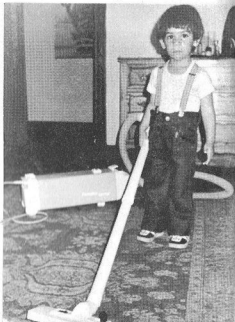
2 yr. 7 mo.