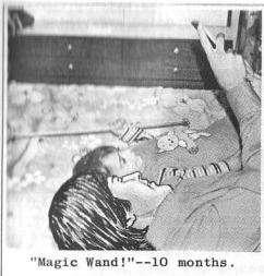
"Magic Wand!"--10 months.

9. SOME OF HIS BASIC LEARNING TASKS HE ACHIEVED BY PLAYING WITH AVAILABLE HOUSEHOLD OBJECTS in repetitious games. He showed a very special interest in examining doors, bottles, big sticks,