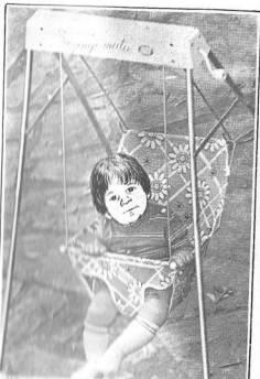
"Our Third World Baby!"