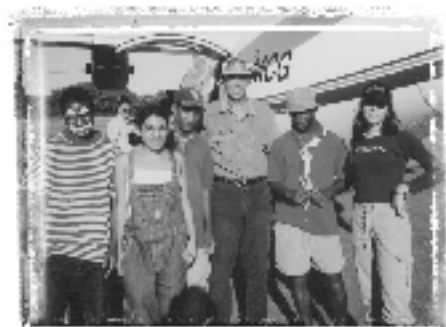
Us and boy scouts in front of plane at Chibuto airport.

We flew in a helicopter to Zonguene, a small village at the mouth of the Limpopo river which overflowed its banks and completely cut off Zonguene and three other small villages from the rest of the province. The Red Cross and the local government weren't aware that this area of about 25,000 people was in desperate need of medical help, food and drinking water.