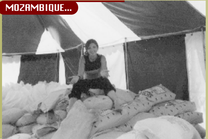
FIND OUT MORE ON PAGE 4

They reached the swollen banks of the Limpopo river by helicopter. They found people desperate for drinking water, 1,500 families clamoring for medical aid, supplies to be distributed, prayers needed for the sick, food for the hungry, and thousands of souls to be won.