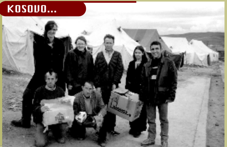
FIND OUT MORE ON PAGE 8

Where God guides, He provides. A look into Kosovo through the Oasis Home's faithful witnessing adventures.—Housing miracles, helping at tent schools, shows for tots, and potential disciples!