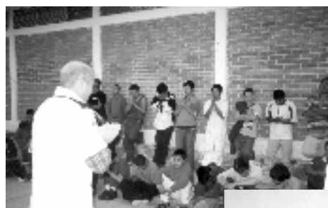
Over 50 boys pray with us to receive the Lord!

When the skit was over and the laughs had died down, we invited them all to pray and ask Jesus into their hearts, which nearly all of them whole-heartedly did! It touched our hearts to see how sincere they were, as they weren’t ashamed to fold their hands and close their eyes to pray in front of each other. It was an exciting experience and we hope to return for another visit!