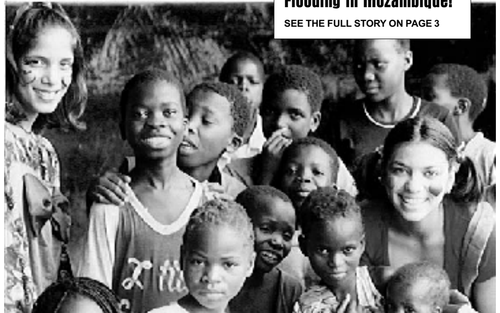
Flooding in Mozambique!

We know that the Lord has a way out of all this, so please pray together with us that everything will work out and that soon we will be able to again avail ourselves of these blessed commodities. ●