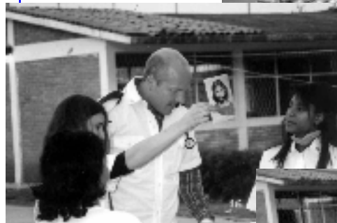
“Dr. Chainbuster,” with the aid of his nurses, perform an emergency maneuver to place the victim of a spiritual heart attack on their operating table.