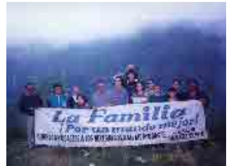
Our Puebla and Morelia team stopping for a picture high in the Sierra Norte mountains after a full and exciting day of giving free food and clothes to the disaster victims of Hurricane Irene, which led to hundreds of them receiving our precious Jesus.

Members Only Password —www.familymembers.com