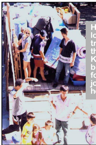
Helping to load the truck with the Kosovars' belongings for their journey home.

At this point we headed for Kosovo. We spent the night in Macedonia, as we couldn’t make it all the way to Kosovo in one shot. It was tough finding a place for the night, as the language was a problem. Some cities had an Albanian majority and at midnight, we finally came upon such a city. The first hotel we asked gave us accommodations for the night. The manager was a young guy who spoke terrific English and we