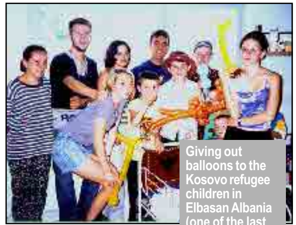
Giving out balloons to the Kosovo refugee children in Elbasan Albania (one of the last refugee camps in Albania).

In Elbasan we stayed at the large building which made up the refugee center. The water came on and off at all different times of day here, and if you weren't careful, you could be caught all soapy in the shower with