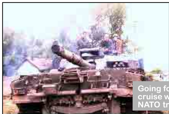
Going for a little cruise with the NATO troops