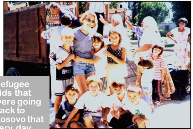
Refugee kids that were going back to Kosovo that very day.

They were just leaving as it was time for their break, but we asked them if they wouldn't mind providing protection during our show. When they heard that our team had several young girls, they said they would definitely be back after they checked in with their command post. It was actually their time off, but they stayed with us during the entire show. They