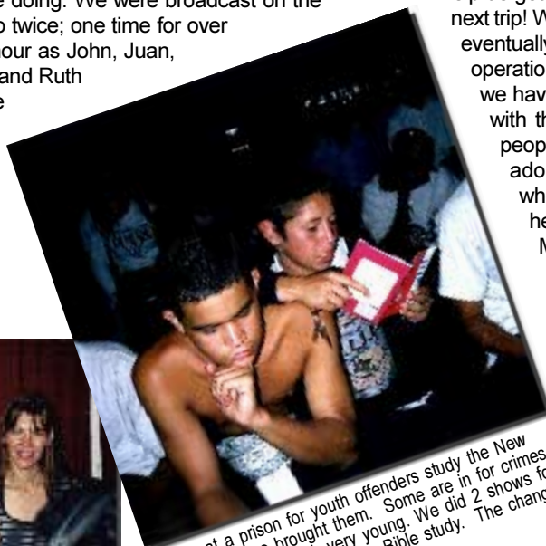
Boys at a prison for youth offenders study the New Testaments we brought them. Some are in for crimes like murder, although very young. We did 2 shows for this prison while there and a Bible study. The change we saw in the boys was incredible.