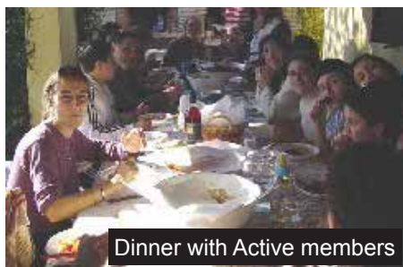
Dinner with Active members

their practical day-to-day experiences, especially on how to relate to and win the Italian field.