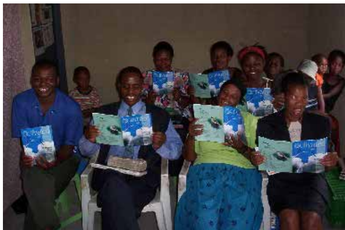
Happy Activated study group, South Africa

We've been going through our stacks of name cards and visiting people and offering tools and Activated . We are surprised at who subscribes sometimes. On a couple of