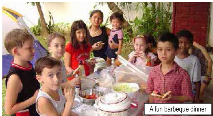
A fun barbeque dinner