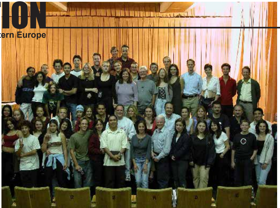
Attendees at the Romanian seminar

This seminar was attended by a lot of junior and senior teens, YAs, SGAs, nationals, and some FGAs. The Lord punched through, and brought to life