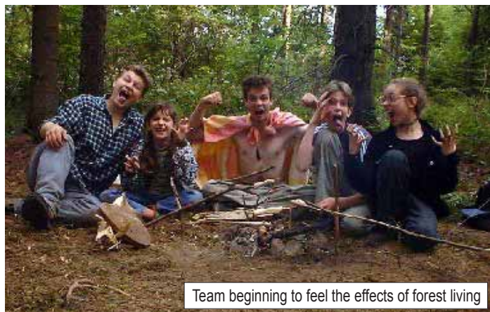
Team beginning to feel the effects of forest living

The morning Word class and devotions was followed by wood carving, hunting for small game, building fires, cooking basic food stuffs in “primitive conditions,” and generally living like “civilized savages” for two days and two nights. Spontaneous stuff like that lives long in the memories of those born with a streak of the wild wind of God in their blood!