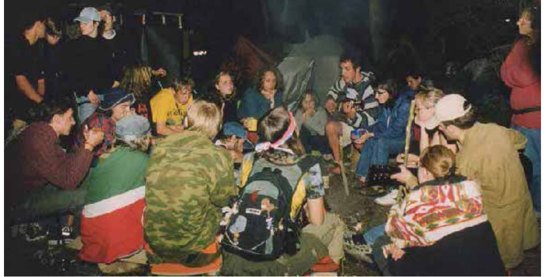
Singing around our campfire

We were able to win over 150 souls, personally witness to countless more, and pass out tracts and posters freely, subscribe several people to the Russian Activated (thanks to the wonderful price-cut our CEAD