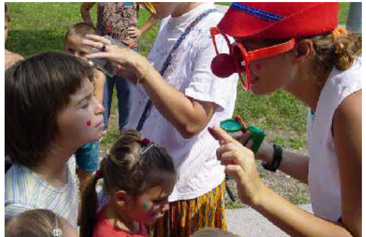
Making the children at a camp happy

I want to thank you so much, because I'm going home renewed, wanting to love others so much—full time—anybody who passes by. I'm so happy!