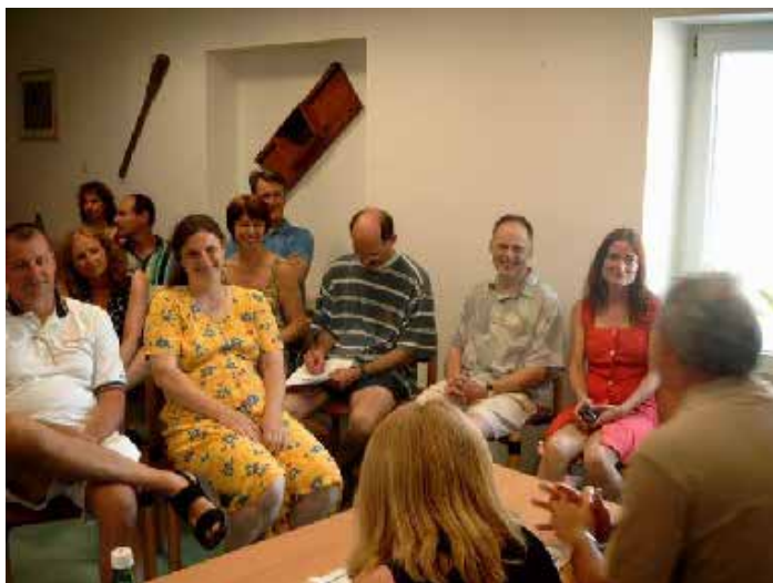
Opening keynote meeting, Germany

We were able to practice two songs with the children together, which they sang to different people we came across as a witness. We put an emphasis on giving tracts and praying with people, having a memory project on witnessing, and encouraging the kids to learn the salvation prayer in the local language. We could see how the positive peer pressure helped some of the children overcome their shyness and the parents agreed that it's important to try to keep the ground gained in this area (witnessing) even after returning to their Homes.