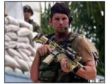
U.S. Marine on guard duty U.S. embassy, Monrovia

babble of the latest Armed Forces game show on an all-night cable channel.