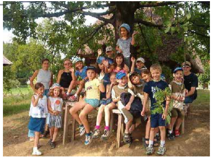
At the ethnographical museum, Romania

It all started with the idea of inviting a few kids from the area for a mini-camp with our kids and their friends. Then we received an all Homes message from the local CP board about a camp they were planning to have for the six- to eight-year-olds that had to be cancelled because they weren't able to find the