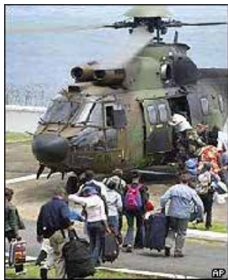
Evacuation by French chopper