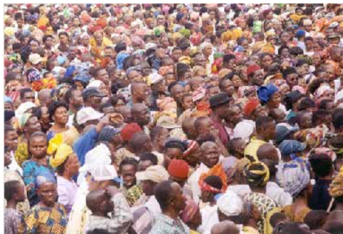
Crowds waiting for treatment

In the wards those recovering from operations as well as those under observation received not only physical care but prayers for healing and the gift of salvation. The spiritual work within the hos-