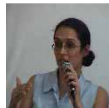
Arabia, FED board

national board members and the Homes, who all worked together to make this plan a blessing and possible to implement. Most of all we are thankful for the Word and the Lord's leading, guiding, and miracles of anointing and supply.