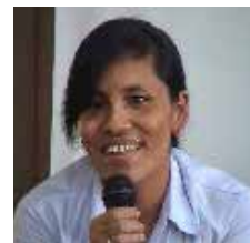
Rejoice, Rose Garden Home