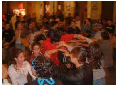
Captions on page 2

Over the past few years, various teams of Family young people have attended to try to reach the youth there with the Words of Life. This year the Lord told us to go to this festival once again. He said many wonderful and inspiring things such as: "This Revolution was built on a crazy Quixote faith. I've used many Quixotes that were willing to