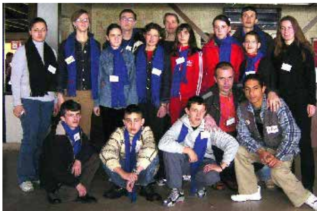
One of the groups from the multi-ethnic ski camp

A big miracle is that we received a grant that we had requested over 10 months ago that would supply us with funds to upgrade our sound system for our school show. The red tape surrounding this grant request was monumental, but the Lord did it for us! So now we have a brand-new setup that includes power speakers, a mixing board, and microphones. We were also able to get a new plug-in guitar, a generator (for when the electricity cuts, which is quite often), and a digital video camera. We give the Lord all the glory for helping this to come through, as it was certainly nothing of ourselves!