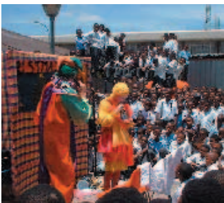
Christmas clown show in Soweto