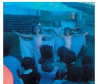
Children performing at our Christmas barbecue