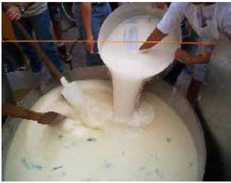
Pouring the maza into the big pot for the tamales