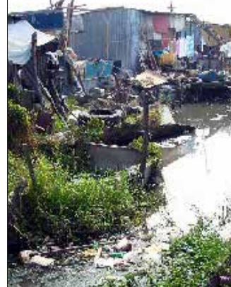
Here's a shot of part of the neighborhood where we held the Posada

ing someone in need. In the end, we lacked none of the many ingredients to make this meal delicious.