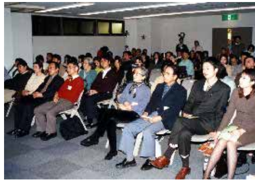
Audience at party