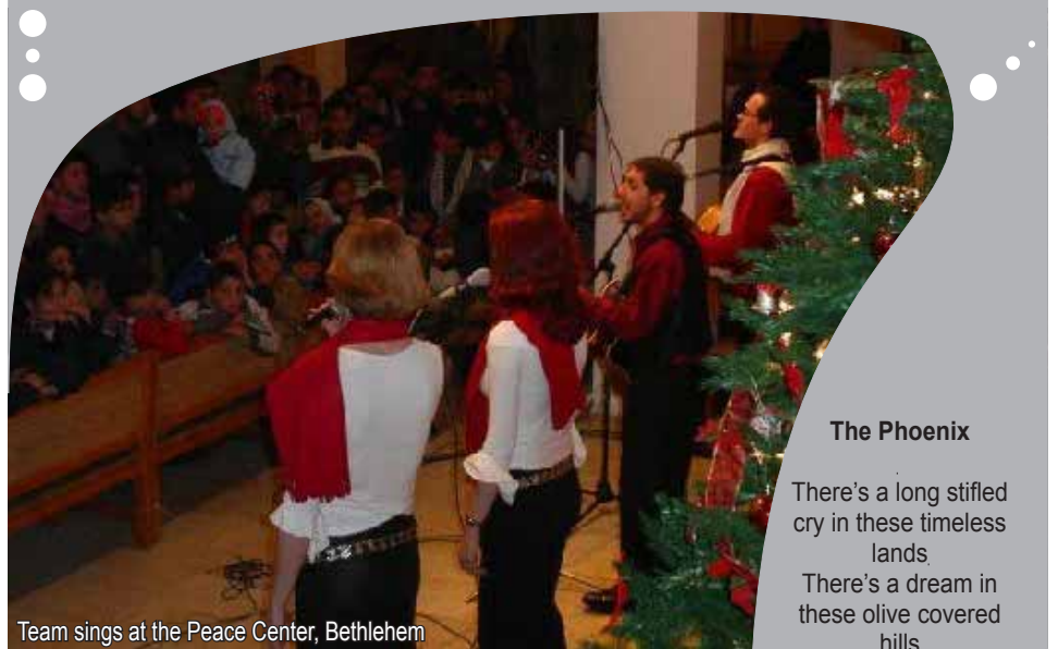
Team sings at the Peace Center, Bethlehem

(Editor's note: To read the tract passed out in Palestine, check out the MO site at: http://www.familymembers.com/overflow/pubs_overflow/33 )