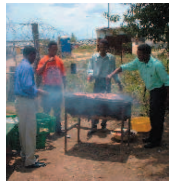
Some of our Active members helping cook the 80 kg of meat the Lord supplied for our Christmas barbecue