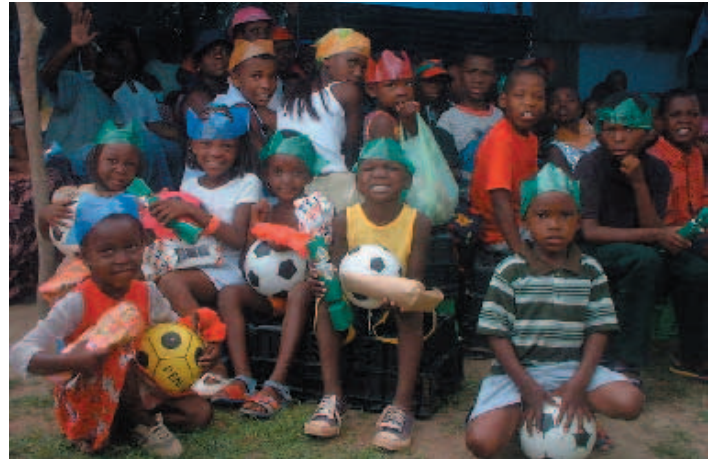
Some of the children on Christmas Day with their presents, Christmas hats, and crackers; many of these children do not receive any Christmas presents if we do not give to them