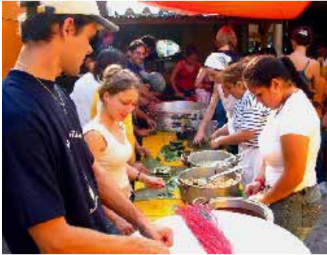
A happy crew making tamales! We worked for 10 hours straight that day on the tamales.

The next thing we knew, we were attending the meeting for the "Association of Restaurants in Boca del Rio" (ARBR). After explaining to them our need, they told us, "We'll take care of it, but you need to find the pots." Great news ... but what do we do about the pots?! So we went back to the vice-admiral. Amazingly enough, he happened to be good friends with the mayor of Alvarado, a nearby city that holds the Guinness World Record for the largest rice dish ever made. They were happy to lend us their pots and the navy was kind enough to transport the pots for us. We knew with these cooks and famous pots, the meal was sure to be a success.