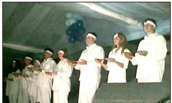
The Sao Paulo Active members doing a presentation