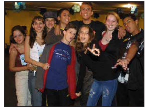
A bunch of young people

tant thing happening at this time in the world!"