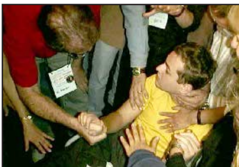
Laying hands on the sick

Since we hadn't worked directly with these precious brethren, we communicated with them ahead of time about their class slots and the Lord showed us that we should give them two classes where they could share about the power of the keys, their healing ministry, and how the Lord led them in the pioneering of their