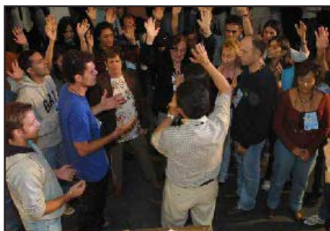
Everyone praises the Lord as someone gets healed