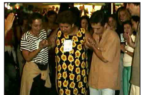
This woman was healed of paralysis