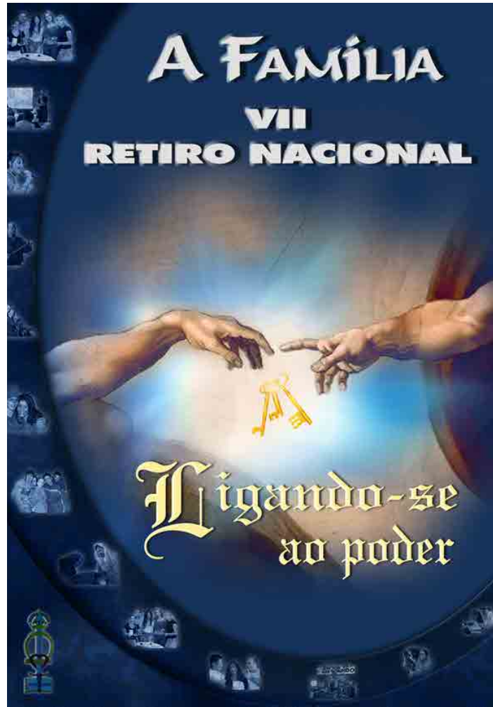
The cover of the retreat brochure we've been distributing before the retreat!

Entitled "Activate the Power," the main goal of the gathering is to help the participants establish a stronger and more intimate personal contact with the Lord, thus having greater power to serve Him, feed their sheep and rise above their daily battles. This retreat has all the earmarks of a true spiritual banquet!