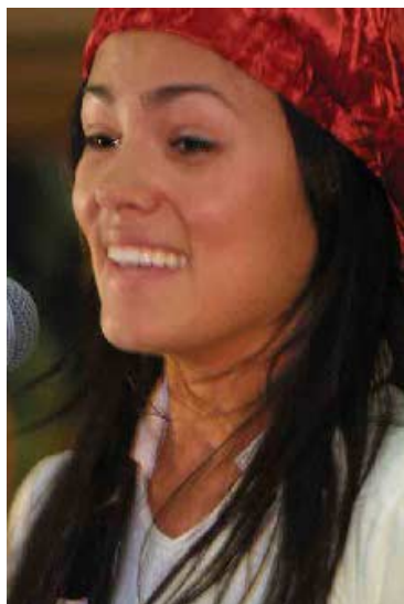
Suzana, sharing her testimony

Suzana Alves, a.k.a. Tiazinha, was at the retreat and gave her personal testimony and signed up for Contato right there at the stand. Having someone nationally famous like her at the retreat was an eye-opener, to say the least. She participated in the “youth group” part of the retreat and loved it! She rocked out just like one of us and fit right in! She was interviewed by local newspapers and TV, where she explained why she was there at our retreat and promoted the Family and Contato !