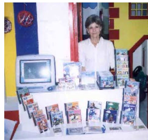
Spring at our Treasure Attic display table at an International Preschool

ing, and let us set up a table displaying our tools at the entrance of the kindergarten. We were able to get out another 30 Treasure Attics and kids CDs. Over the next few weeks she hosted two more open houses and invited us back for those also. Our clown helped with ballooning and keeping the children happy while she and her staff were able to explain to visiting parents about their school. This lady was so flipped out about our tools that our tool display became a part of their little "tour" for visiting. It was almost funny for us when going into the school's office where they were storing school supplies, to see their huge stack of Treasure Attic VCDs. They almost had more than we did, ha!