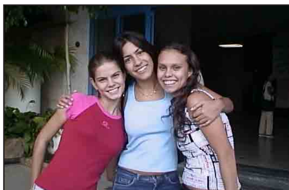
Three Family teens at the front of the hotel