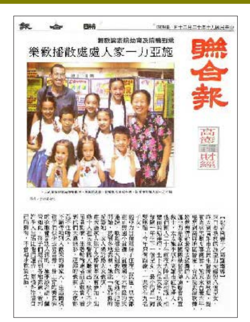
The article in the United Daily News

song. They turned off the big TV, parents brought their sick children with their trailing IV drips, old folks in wheel chairs, doctors and nurses, everybody joined in.