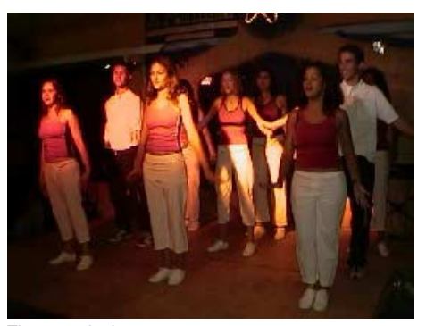
The teen singing group