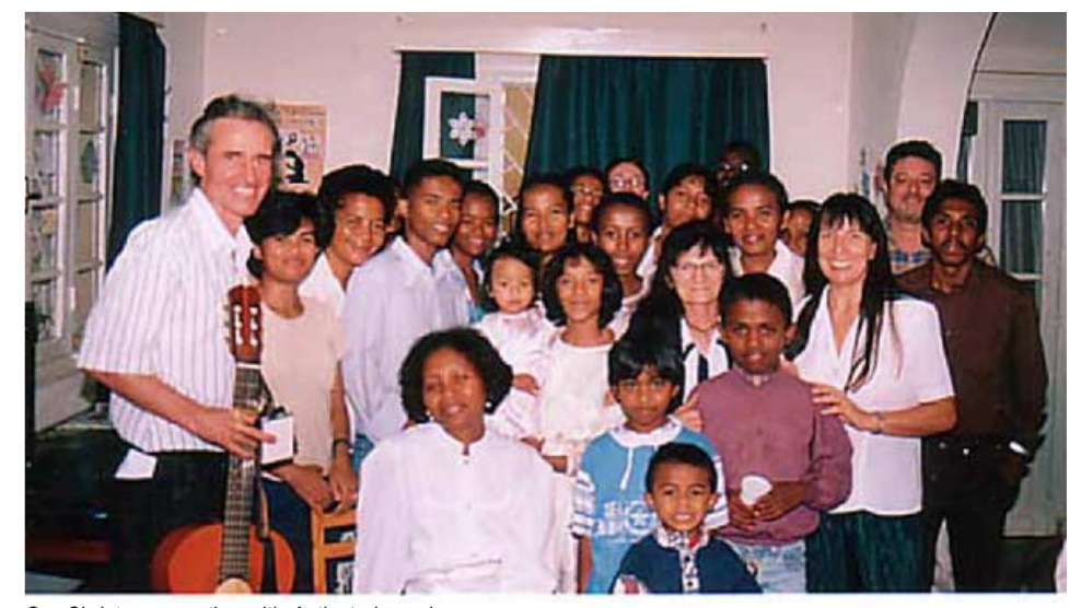
Our Christmas meeting with Activated members

Activated: In the beginning of December, we held a Christmas meeting for our Active members, to give them the vision to do their best for