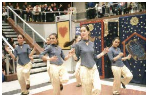
The girls performing

A friend, one of the managers of a five-star hotel, offered to let us have a stand of our Christmas materials set up in his hotel every Sunday during