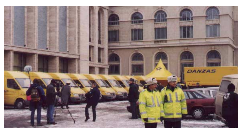
Romanian Police guarding the 10 vans and TIR truck full of toys which just arrived from Germany (25,000 toys)