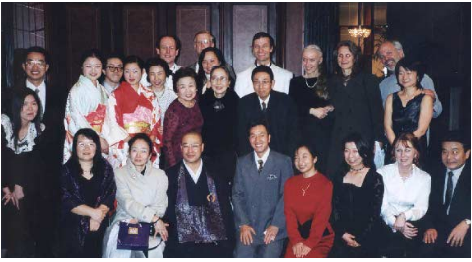
A group shot of Family and friends at the event

Here are some testimonies about our visitors: