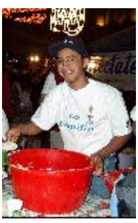
•Feeding the multitudes