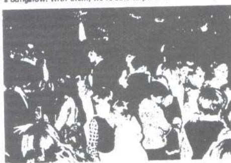
The children's disco dance held in our large army tent. "Think how important play is, before they even start to go to school or anything, children learn so much through play."