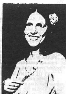
GRACE--"The most beautiful part of you is that lovely radiant happy smiling Spirit-filled face!"