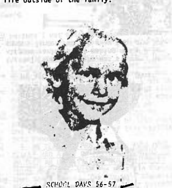
SCHOOL DAYS 56-57

8. AT THE TENDER AGE OF NINE I REALLY MADE THE DECISION WITH MY WHOLE HEART TO LEAVE SCHOOL & FRIENDS & GO WITH YOU TO BE A MISSIONARY, taking my school books with me so I could learn on the road! I remember I really liked school at the time, because I was just beginning to have some friends outside of our own immediate family & associates.--Which is all I had known very intimately before, because we never stayed in one place long enough & I was too young to appreciate any social life outside of the family.