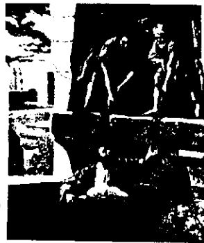
Unconventional Paul escapes the wrath of the System. Acts 9:22-28.

that the whole population would take sides either for or against Christ. Acts 14:4. "But the multitude of the city was divided: & part held with the Jews, and part with the apostles." 8. AFTER BEING DRAGGED OUT OF A CITY & BRUTALLY STONED , Paul got up & went right back into the city to finish his job. Acts 14:20. "Howbeit as the disciples stood round about him, he rose up, & came into the city; & the next day he departed with Barnabas to Derbe." 9. PAUL MADE PASTORS RIGHT OUT OF THE NEW CONVERTS within the newly established churches. Acts 14:23. "And when they had ordained them elders in every church, & had prayed with fasting, they commended them to the Lord, on whom they believed." 10. HE CAST THE DEVIL OUT of a fortune teller in public, but not until he allowed her to follow him around the city for many days, announcing his mission. Acts 16:17-18. "And it came to pass, as we went to prayer, a certain damsel possessed with a spirit of divination met us, which brought her master much gain by soothsaying: The same followed Paul & us, & cried saying, 'These men are the servants of the most high God, which shew unto us the way of salvation.'" 11. HE & HIS PARTNERS SANG AT MIDNIGHT IN PRISON GREAT