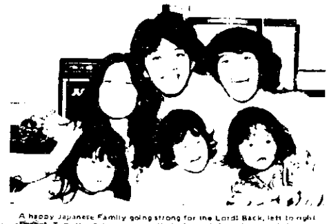
A happy Japanese family going strong for the Lord! Back, left to right: Mommy & Daddy. Front, left to right: three lovely boys. When the seed is sown, it grows!