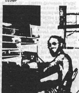
He in the office busy at work on the photo story of how the MacBooks were made.