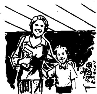
Grandpa as a young boy with his mother. Will you choose to serve Jesus, too? God bless you!