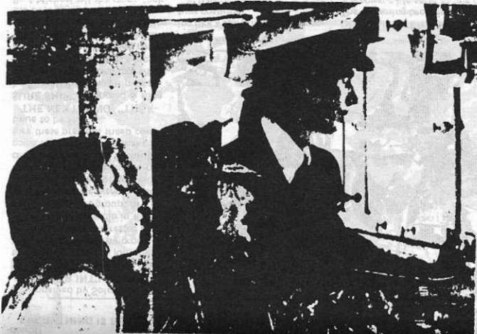
The storm scene! To Phoebe's frantic question, "What are we going to do?" Simon replies, "We're going to have to trust the Lord!"

ets of water flying around & had blanketed off the bridge windows to make it dark inside. And after all that the "Hermes" crew voluntarily stayed aboard for a couple of hours when we arrived back in port to keep the power on so we could finish all the last-minute shots! These men work from 7:00 a.m. to 8:00 p.m. seven days a week, nine months a year! GBT for helping us so much! AND THANK THE LORD FOR OUR DEAR CAPTAIN & HIS FIRST MATE who were with us too, thru the Words of this encouraging vision! TY!!