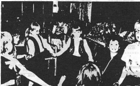
Singing "You Gotta Be A Baby" to old folks!

addresses at singing appointments. Go up to the director & talk privately with him about helping with a donation to cover costs; do this after the sample. Be faithful to write thank-you letters. Happy singing! (Amen!)