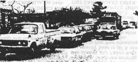
Traffic leaving the city, blocked for kilometers!

ning of a long holiday weekend & the main roads out of the city were backed up as far as 8 km. in some places.