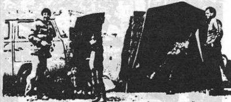
Asher, Job & their children outside the house at our overnight refuge camp—9 adults & 10 children at its peak, all "dwelling in the secret place of the Most High"!

WE IMMEDIATELY LEFT TO RETURN HOME. All along the way we saw that people had evacuated their houses & apartments & were huddled around fires in fields or in their automo-