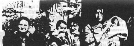
Athens newspaper photo shows survivors of the quake seeking refuge in the streets. "These are the ones that we need to be praying about & ...Caring for & striving to help...whom we need to reach with the Gospel & the Love of Christ & the Message of Salvation..." (No. 959:11:2)

WHAT A CONFIRMATION OF THE URGENCIES OF THE TIMES & the need to be prepared now, found in the Letters! Another tremor came at 4:30 a.m. & another strong one at 7