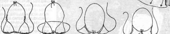
Normal way-- add beads!

There are quite a few different ways to wear this bikini top. See pictures below! You can add large beads to the ties--this is pretty on a solid color suit.