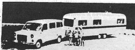
Fiona & her 6 children mountin' the mountain with their mobile home!

"YOU CAN ADAPT YOUR TAPE RECORDER TO PLUG INTO YOUR CAR BATTERY using a transformer. Also with laundry being a problem while