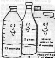
Carbonated water in glass bottles in plastic bottles

CARBONATED MINERAL WATER: With carbonation it is guaranteed at least 2 years, some say from 3-5 years. One company did an experiment whereby it lasted 10 years. The storage is the same as above. This type needs no extra care as there are water purifying elements already contained therein. It will lose about 2 grams of its carbonation quality after 6 mos. but still retains some. Usually