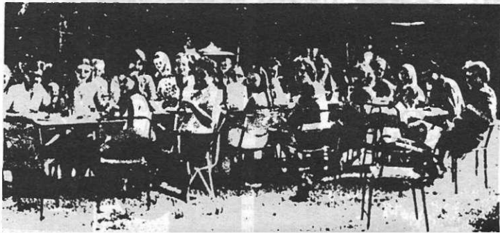
MWM united dinner under the trees, including visiting Family from town!