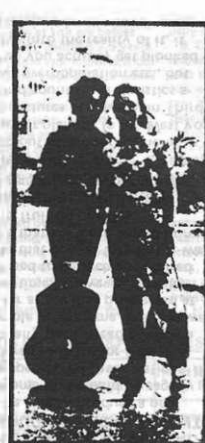
Indian nationals & MWM "roving minstrels" who travel to out-of-the-way towns to meet & inspire MWM Club members in India. (photo from MWM's Club Map)

At the end of last year we got a large map of India & marked with a dot every town, city or small village from where we had received a letter. How thrilled we were when we saw the map completely speckled with dots in an almost even spread from east to west & north to south! "MUSIC WITH MEANING" WAS REACHING PLACES WE COULDN'T POSSIBLY HAVE REACHED BEFORE, & people we couldn't reach before—lonely boys & pretty girls who would be too shy maybe to speak to us on the street because we're foreigners or because they're so guarded by their parents & chained by their traditions. But now in the privacy of their own homes our music & message of love could, without barrier or distraction, penetrate right into their hearts & evoke such beautiful & touching heartcries in response.